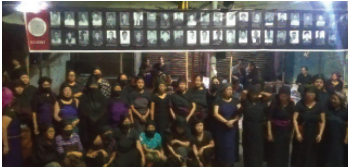
'Black September' observance_ Floral tributes paid to 53 Meitei martyrs