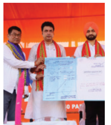
TRIPURA BUREAU AGARTALA 17 SEP