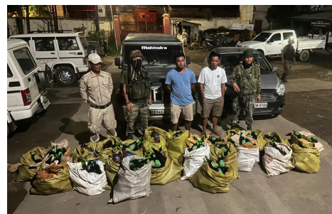
KRC TIMES MANIPUR BUREAU IMPHAL, 19SEP

Myanmar liquor smuggling into Manipur worth around Rs 80, 000 in the regional markets has been recovered after 2 tribal smugglers were apprehended in Manipur's Churachandpur district bordering Myanmar on the south, official sources said.