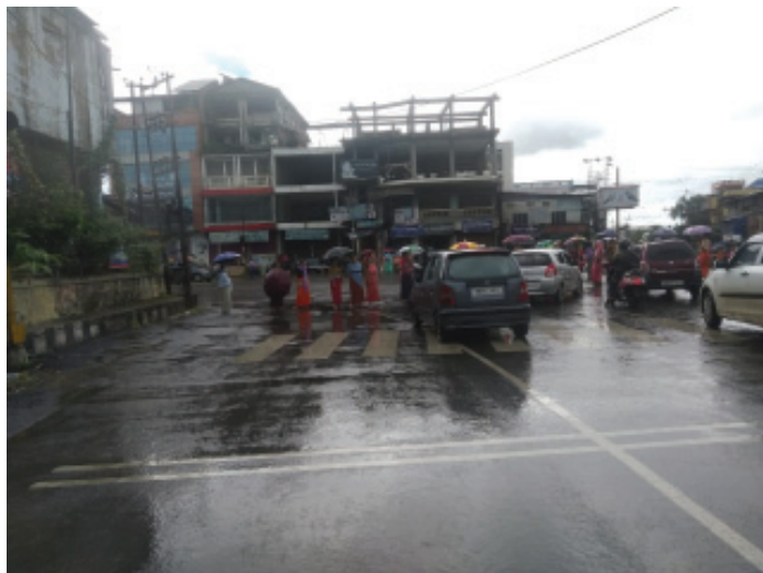
all types of vehicles, including those of security forces were off the roads, inter-district, inter-state buses, and trucks did not operate. Markets,