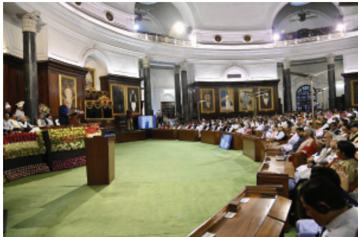
NEW DELHI, 19 SEP A function was organised in the Central Hall today to commemorate the

rich legacy of the Parliament of India as the Members came together to bid adieu to the historical build-