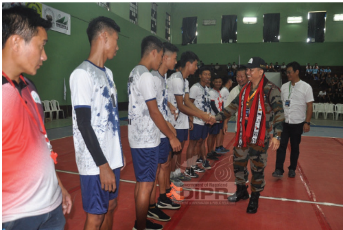
Players being introduced to Col. Rahul Gurung, Commandant 12th Assam Rifle, Mokokchung during the inaugural match of 16th Imchaba Master Memorial Nagaland Open Volleyball Trophy 2023 at Multi-Purpose Sports Complex, Mokokchung on 19th September 2023. (DPRO Mokokchung)

KOHIMA: The 16th edition of Imchaba Master Memorial Nagaland Open Volleyball Trophy 2023, organized by Mokokchung District Volleyball Association (MDVA), got underway at Multi-Purpose Sports Complex, Mokokchung on 19th September 2023.