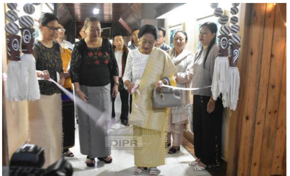
Lady wife of Chief Minister of Nagaland Kaisa Rio inaugurated the screening of the documentary film 'Where Cotton Flowers Grow' and Mini Exhibition-cum-Sale at Directorate of Art & Culture, Kohima on 19th September 2023. (DIPR)

The mini exhibition cum sale constituted an exceptional display of authentic indigenous textiles and crafts, the talent, richness and diversity of the local crafts persons. She believed that the screening of the Documentary Film and holding the mini exhibition cum sale will create