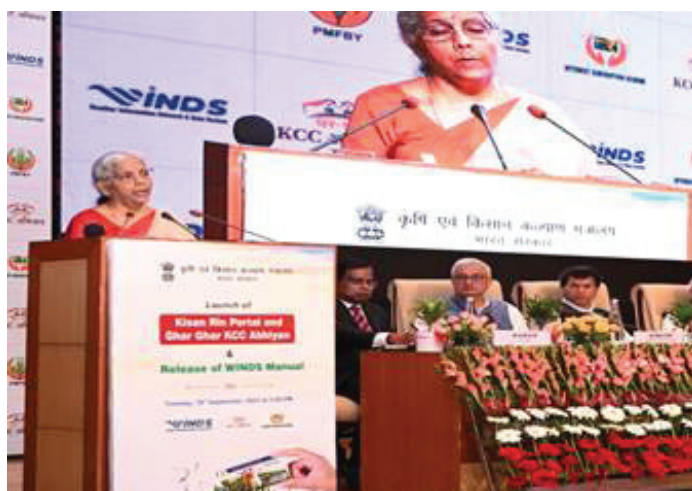
NEW DELHI, 19 SEP

In a landmark event today here, Union Finance Minister Nirmala Sitharaman & Union Agriculture Minister Narendra Singh Tomar unveiled initiatives focused on agri-credit (KCC & MISS) and crop insurance (PMFBY/RWBCIS). The Ministry of Agriculture & Farmers Welfare launched three initiatives, namely the Kisan Rin Portal (KRP), KCC Ghar Ghar Abhiyaan, an ambitious campaign aiming to extend the benefits of the