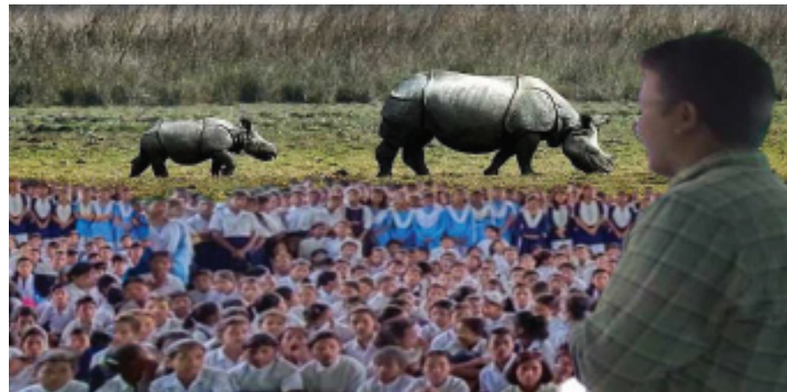
An Aaranyak volunteer addresses the students who turned up in large numbers at the Rhino Goes to School' campaign hosted by wild life conservation organization Aaranyak.