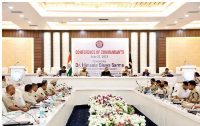
Assam CM Dr Himanta Biswa Sarma chairs the conference of commands on Monday held at Lachit Barphukan Police Training Academy, Dergaon.