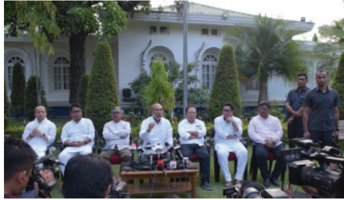
Manipur CM N Biren Singh briefs the press about his government's initiatives taken so far to restore peace and tranquility in the state.

He continued that the situation in the State is returning to normal. Other than some small incidents happening at different places, timely intervention by security forces and cooperation from the public had made it possible for the State to return to normalcy gradually, he added. Stating that the Government had been putting all efforts to secure the safety of the people, he appreciated all the security forces deployed in the State