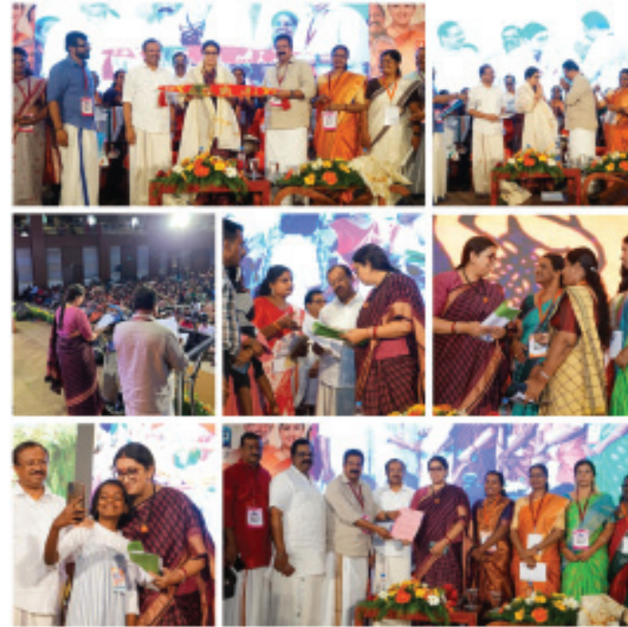
Union minister Smriti Irani attends women's convention on Monday at Thiruvanthapuram organised by Bharatiya Mazdoor Sangh.