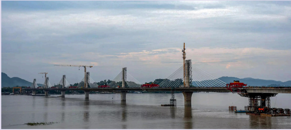
such integrated tunnel system in the country. The strategic corridor will connect Gohpur on the north bank

If approved, the project would mark a major milestone in India's transport infrastructure expansion, particularly in the Northeast. The proposed tunnel is designed as a twin-tube underwater structure that will accommodate both vehicular traffic and railway lines - the first