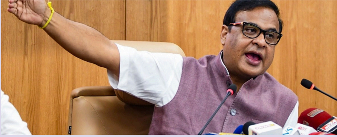
"A number of young candidates have been given tickets this time," he said, referring to constituencies

Highlighting the candidate profile, he said the BJP has fielded a significant number of younger faces in line with its earlier commitment to promote youth in politics.