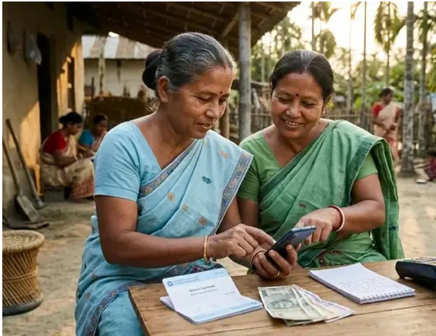
Assam's welfare trajectory.

Both arguments hold some weight. But neither fully captures the continuity that underpins