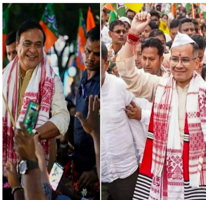
route. Chief Minister Himanta Biswa Sarma and

The roadshow is scheduled to begin at Arya Vidyapeeth Playground at 5 PM and traverse key stretches of the constituency before concluding near Nepali Mandir. Party leaders are expecting a large turnout along the