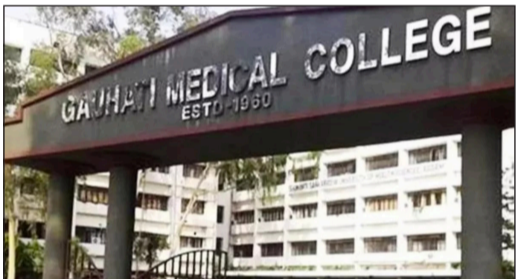
KRC TIMES NEWS DESK

POSH Complaint Filed Against GMCH Principal; WCD Department Seeks Immediate Action