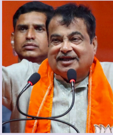
spread negativity for someone else. People believe in our work because of our work," he said.

"We want to fight and win elections based on the positive work we have done. We have changed the future of our country. We have provided employment. We built roads, airports, and railways. We are protecting our farmers. This is our strength. We don't need to