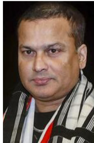
independent and will continue on the basis of evidence collected in Assam," he said, underlining that

the case in Guwahati is based on a different set of allegations and legal grounds.