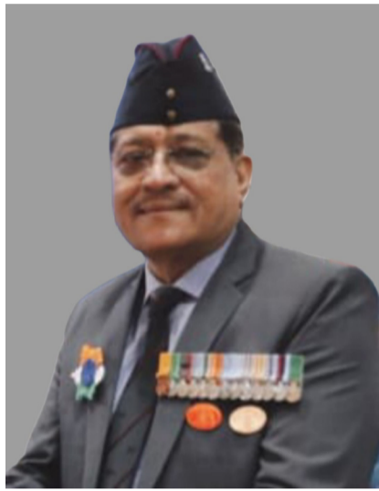
A Silence That Masks Strategic Tension.

The guns have fallen silent for now. The recently announced ceasefire involving Iran, Israel, and the United States has brought a temporary halt to what threatened to spiral into a wider regional war. Oil markets have steadied, the Strait of Hormuz has reopened to cautious traffic, and diplomatic channels long frozen are flickering back to life. Yet beneath this fragile calm lies an uncomfortable truth, this is not peace. It is a pause, calculated and compelled, where each actor is using the silence not to reconcile, but to recalibrate.