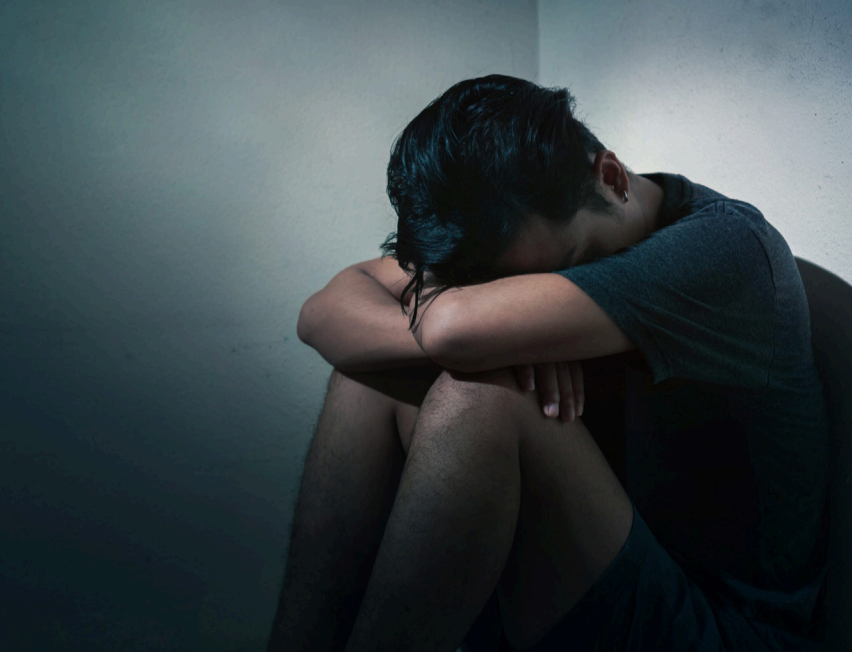
Economic distress was identified as the leading contributing factor in 38.08 per cent of cases, followed by family conflicts at 28.47 per cent. The study also found statistically significant associations between the method of suicide and both age

Findings show that males accounted for 67.97 per cent of victims, with the 11-20 age group comprising the largest share at 30.6 per cent. Hanging emerged as the most common method, accounting for 75.44 per cent of cases.