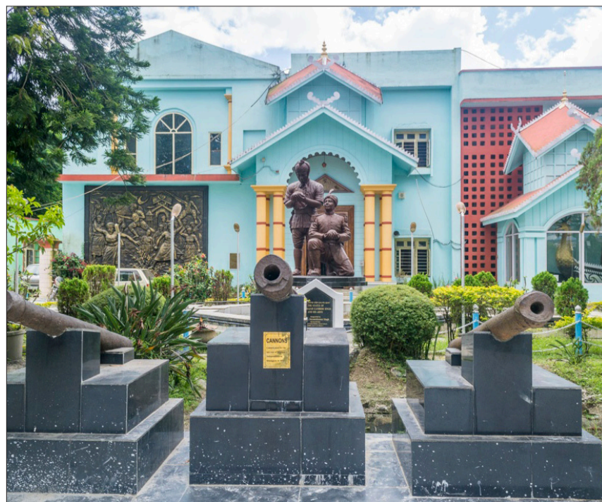
Officials noted that the museum has faced challenges in recent years, including reduced visitor