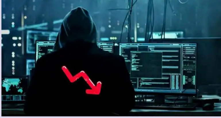
downs on cyber offenders and increased public awareness campaigns carried

Police sources attributed Assam's decline in cyber crime to intensified crack-