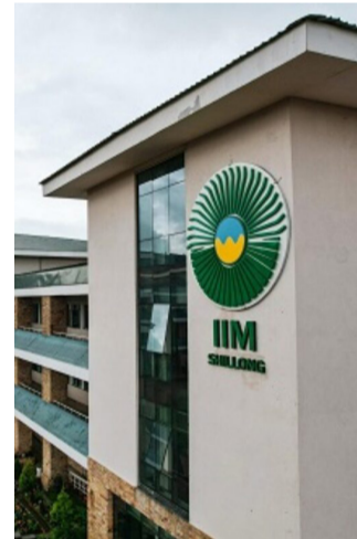
becomes one of the select Indian Institutes of Management to earn the distinction.

With the recognition, IIM Shillong joins around 30 AACSB-accredited institutions in India and