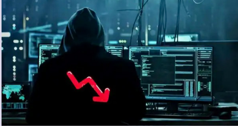
downs on cyber offenders and increased public awareness campaigns carried

Police sources attributed Assam's decline in cyber crime to intensified crack-