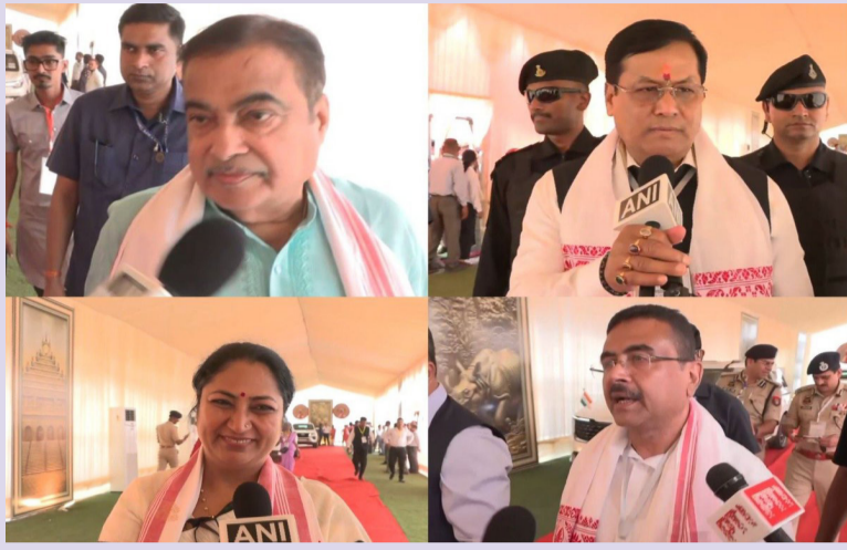
country," he said. Delhi Chief Minister Rekha Gupta extended warm wishes to the Assam CM. "Due to the blessings of the public, the BJP

"This is a great day, and we are all proud as the Prime Minister has come along with all other senior ministers from the government of India, and also the Chief Ministers and Deputy Chief Ministers from the different states have arrived. Under the leadership of Dr Himanta Biswa Sarma, we'll be working to make Assam one of the most developed States in the