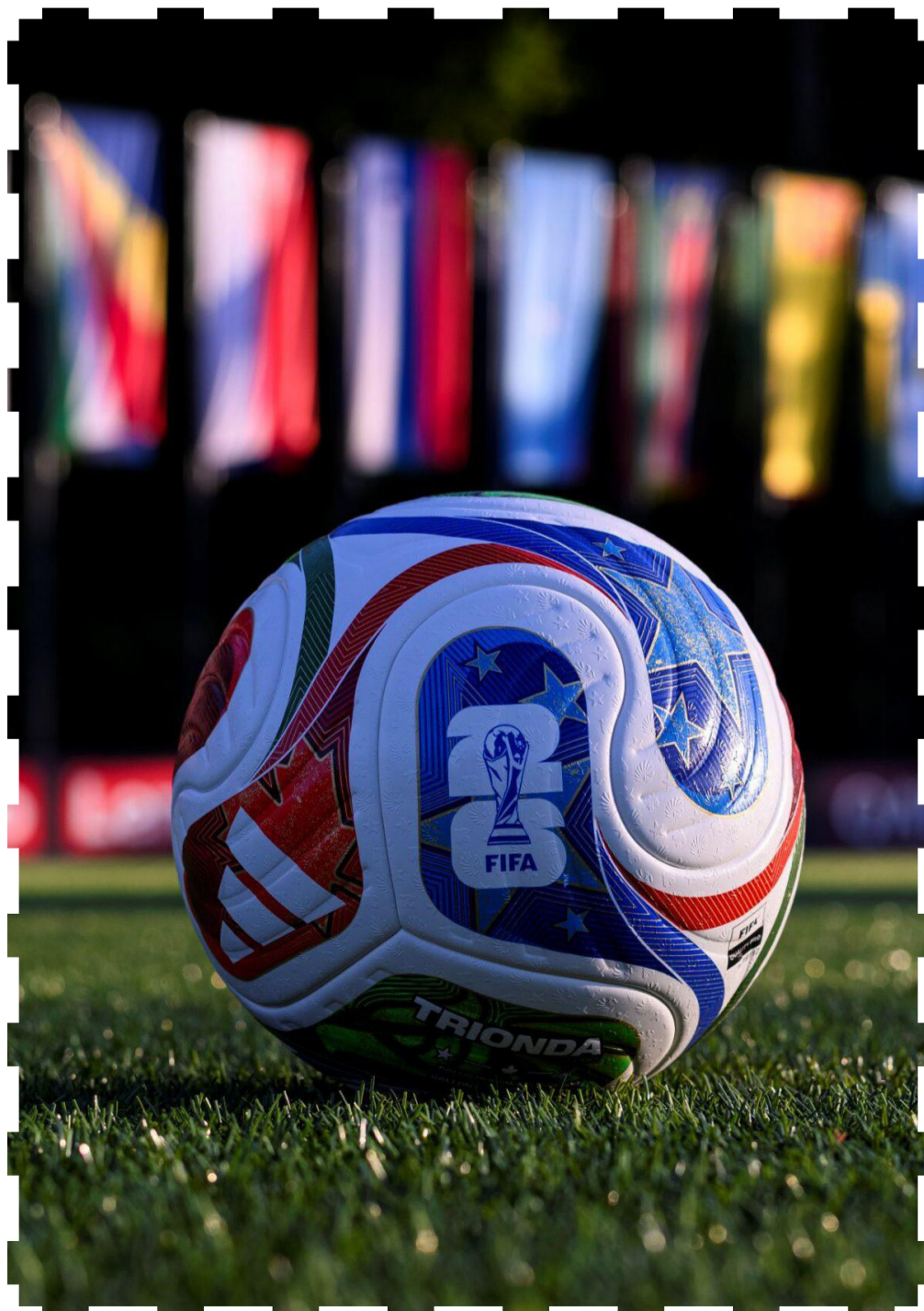
workloads across a demanding schedule. For football supporters, however, the format

European heavyweights such as Spain, Germany, England, Portugal and the Netherlands will similarly believe they possess the quality required